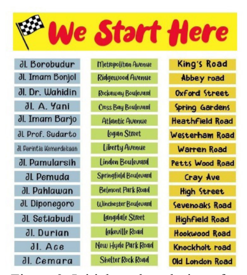
Figure 3. Initial product design of street's name (prototype 1)