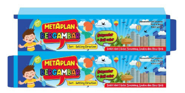
Figure 5. Box design for street names and buildings names

Improvements were made to the pictorial metaplan design by adding several variations of images, color (on the background of the mini dictionary section) and more detailed ornament placement.