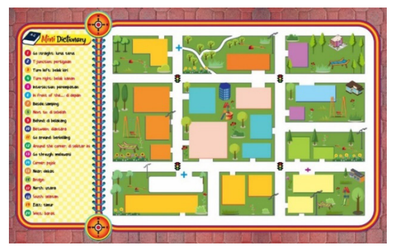
Figure 2: Initial product design of pictorial metaplan (prototype 1)

dictionary (on the left of the pictorial metaplan section). This pictorial metaplan will function as a city plan. This pictorial metaplan is equipped with pictures of streets and buildings that can facilitate students in learning English material with the theme 'Getting Direction' at the informal basic English speaking level. Students can immediately practice showing the way with the help of this pictorial map.