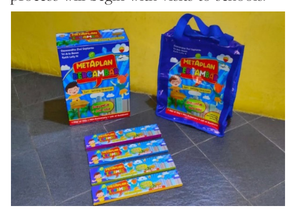
Figure 6. Complete package of pictorial metaplan

The final stage of implementing this product development is the mass production stage. Based on several stages of revision, product testing and questionnaire results, the pictorial metaplan product development process with the theme 'Getting Direction' has been completed. This pictorial metaplan product is ready to be mass produced and sold in the market. This pictorial metaplan with the theme 'Getting Direction' will be mass produced by a graphic designer and printing company called 'Prodesign'. The marketing and sales process will begin with visits to schools.