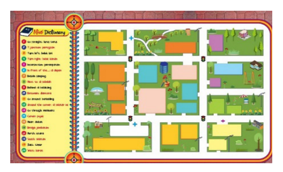
Figure 4. Design from pictorial metaplan Design revision description

sign revision stage, the author added a box as a container for streets and buildings names. The application of making boxes for streets and buildings name containers is to accommodate these items of streets and buildings names so they are not scattered and lost.