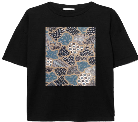
Figure 2. Design of the innovation product (oversized).

This innovation is not only adding or embedding batik into clothing which is a current trend, but also pays attention to various aspects such as aesthetics and color harmony so that it can attract the interest of various parties. According to the data researchers obtained, 68% of respondents said they would be very interested in the products of this innovation. 91% of respondents even stated that they are willing to contribute in implementing batik acculturation innovations into fashion trends. If this innovation is able to run according to expectations, the Indonesian national iden-