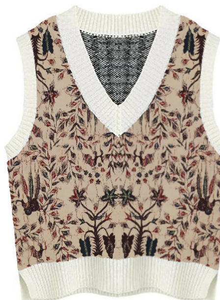
Figure 1. Design of the innovation product (vest).

For this reason, researchers want to produce an innovation that can reaffirm the national identity that has long been displaced by foreign cultures by acculturating batik into the current fashion trend. That way, the people's national identity as Indonesian citizens will again be seen in their dress style, without worrying about being out of date. People can still keep up with fashion developments without having to lose their identity or identity as Indonesian citizens. All of our respondents also mentioned that it is very possible to create innovations and products that acculturate batik with today's clothing styles. The initial design of this innovative product design is as follows: