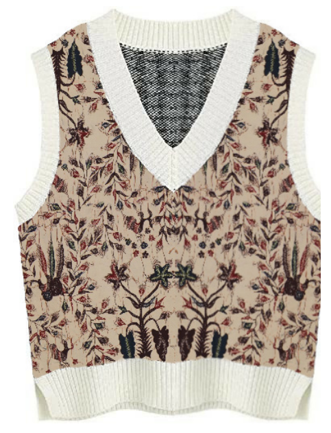
Figure 1. Design of the innovation product (vest).

For this reason, researchers want to produce an innovation that can reaffirm the national identity that has long been displaced by foreign cultures by acculturating batik into the current fashion trend. That way, the people's national identity as Indonesian citizens will again be seen in their dress style, without worrying about being out of date. People can still keep up with fashion developments without having to lose their identity or identity as Indonesian citizens. All of our respondents also mentioned that it is very possible to create innovations and products that acculturate batik with today's clothing styles. The initial design of this innovative product design is as follows: