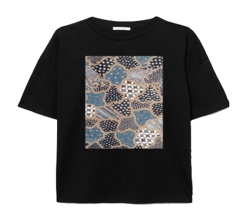
Figure 2. Design of the innovation product (oversized).

This innovation is not only adding or embedding batik into clothing which is a current trend, but also pays attention to various aspects such as aesthetics and color harmony so that it can attract the interest of various parties. According to the data researchers obtained, 68% of respondents said they would be very interested in the products of this innovation. 91% of respondents even stated that they are willing to contribute in implementing batik acculturation innovations into fashion trends. If this innovation is able to run according to expectations, the Indonesian national iden-