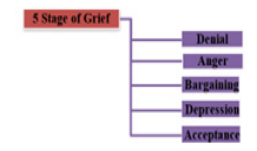
Figure 1. Five Stages of Grief proposed by Kübler-Ross, (1969)

Due to the process of grieving, Elisabeth Kübler Ross (Kübler-Ross, 1969) provides anunderstanding of the 5 stages of grieving as follows: