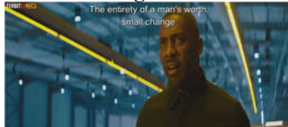
Figure 10: Brixton while explaining human development to the Professor. Humans must evolve professor, without the increase of etheon the human body is not very valuable.