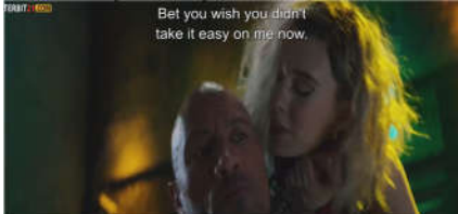
Figure 8: Apart from being a skilled woman in fighting, Hattie Shaw is also very confident in her abilities against Luke Hobbs. Some of the words he said "Bet you wish you didn't take it easy on me now" "you will sleep now, everything will feel like a dream" shows that Hattie Shaw is confident that she can beat Luke Hobbs.