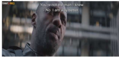
Figure 9: As brixton explains how he can live again. Brixton Lore feels superior because he has become a modified human who has more abilities.