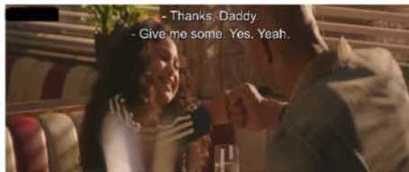
Figure 2: Luke Hobbs was talking with his daughter.

Luke Hobbs The scene shows that Hobbs loves his daughter, he takes the time to go out together and several times Luke Hobbs and his son exchange news via video call.