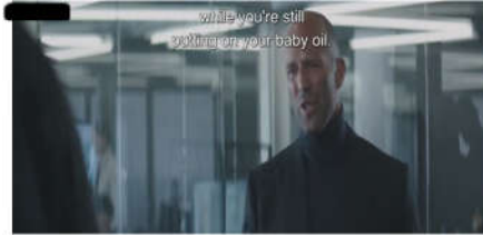
Figure 5: Shaw and Hobbs taunt each other in the CIA office.

"it's your nasally, prepubescent, harry potter voice" said Luke Hobbs when Deckard Shaw said "I will finish this work while you are still putting on your baby oil".