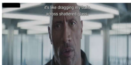
Figure 3: Hobbs and Shaw taunt each other in the CIA office.

When Luke Hobbs said "everytime you speak, it's like dragging my balls across shattered glass and it hurts" Deckard Shaw replied "well for me, its not your voice, but your face. Looking at it makes me feel like God is projectile vomiting right in my eyes".