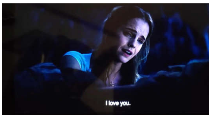
Belle: "Come back, please don't leave me, I love you." (Looking at The Beast) The Beast: (looks lifeless in Belle's lap) (Duration 01.52.10- 01.52.18, Beauty and The Beast 2017, 2017)

The day the Beast was shot multiple times and killed by Gaston witnessed the love story of Belle and the Beast.